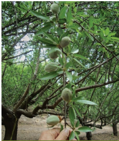
Standard Grower Practice